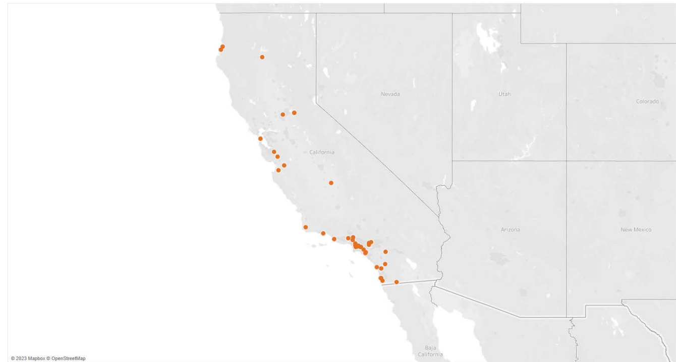
MIP Round 2 Awardee Map

© 2023 Mapbox © OpenStreetMap Map based on Longitude (generated) and Latitude (generated). Details are shown for Latitude and Longitude. The data is filtered on Round, which keeps Round 2.